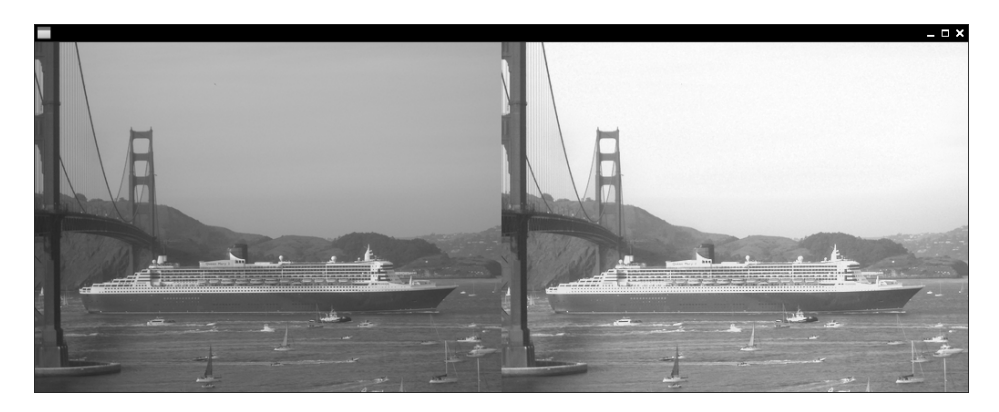
Figure 3–1 The original and transformed image

There is a standard functional interface for this purpose: UnaryOperator<Color>. That is a good choice, and there is no need to come up with a ColorTransformer interface.